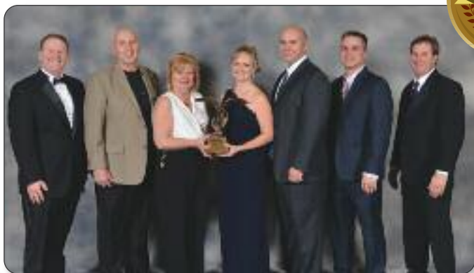
Marty Robbins Roofing Company, Inc. Dothan, Alabama