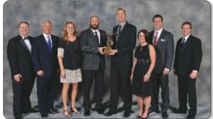
Damschroder Roofing, Inc. Fremont, Ohio