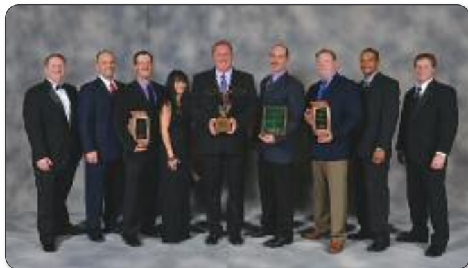
I.C. Enterprises, Inc. Effingham, Illinois