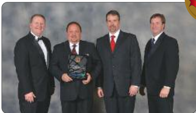
C E Davis Contracting, LLC Ford City, Pennsylvania