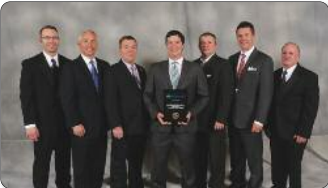
Urethane Unlimited Gratis, Ohio