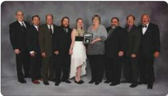
Colorado Commercial Roofing, Inc. Colorado Springs, Colorado