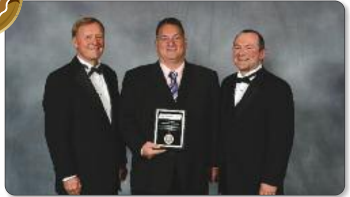
Prestige Pro Contracting Mahopac, New York