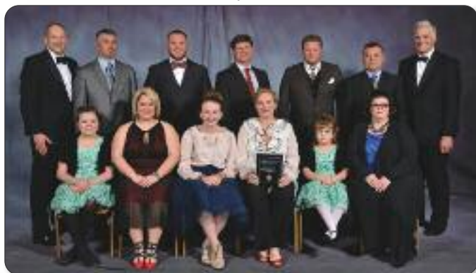
Matthews Construction Russellville, Kentucky