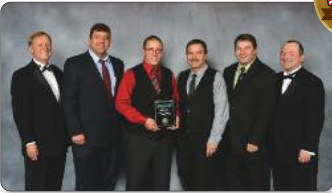
Diekevers Roofing, Inc. Grand Rapids, Michigan