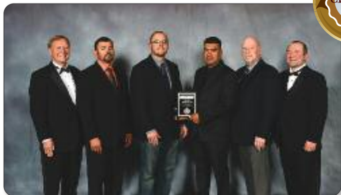
Southwest Spray Foam Santa Fe, New Mexico