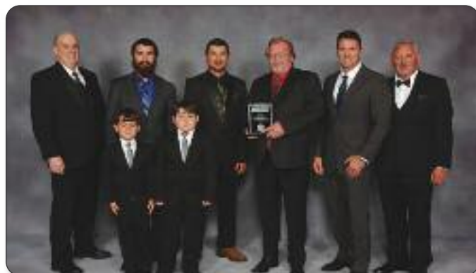
J.T. Roofing Melbourne, Florida