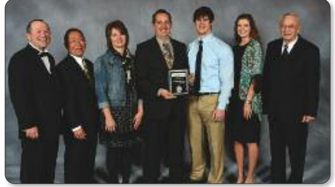
Geisler Roofing, Inc. Concordia, Kansas