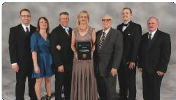
Harrison Roofing Co., Inc. San Angelo, Texas