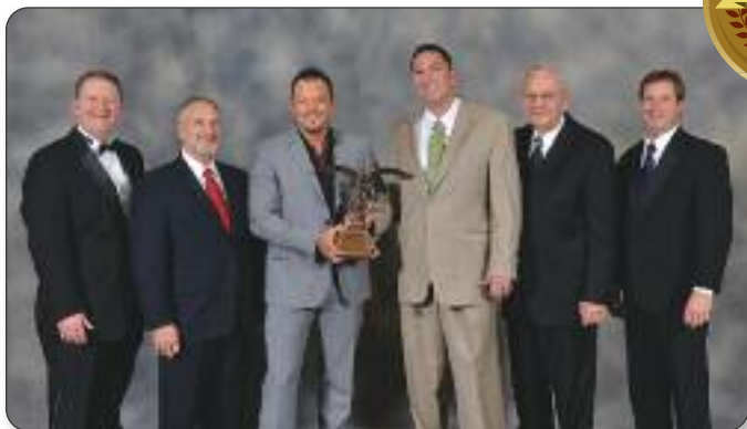
4 Star General Contracting Norman, Oklahoma