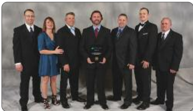
GKS Commercial, Inc. Lubbock, Texas