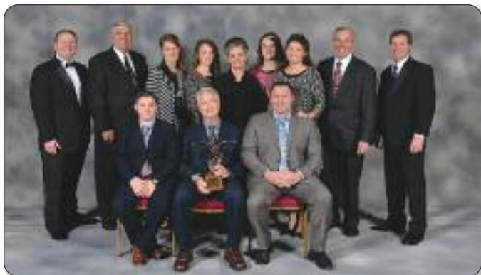
Harold Hall Roofing, Inc. Stuttgart, Arkansas