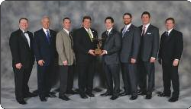
Cotterman & Company, Inc. Minster, Ohio