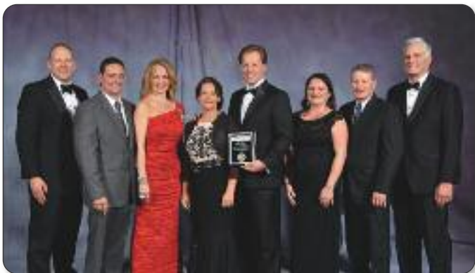
Seaside Roofing Co. Stuart, Florida