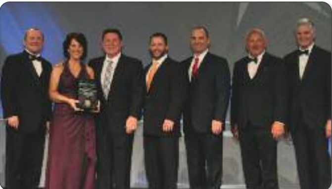
Beckwith Commercial Roofing, Inc. Clinton, Iowa