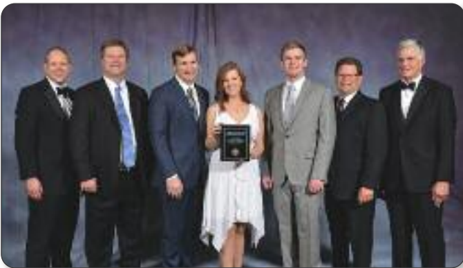
United Roofing & Sheet Metal Bryan, Texas