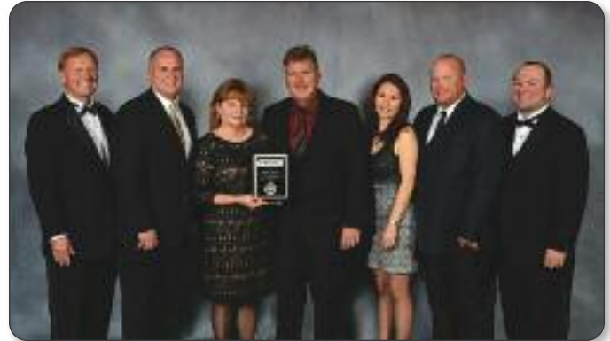
Bourdeau Contracting St. Charles, Missouri