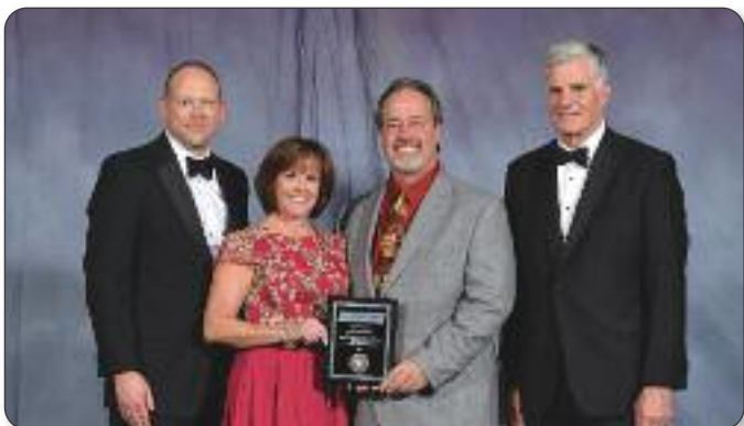
Roof Tec Systems Jacksonville, Florida