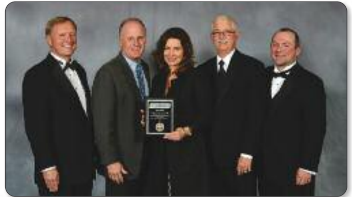
Energy Roofing Technology Kearney, Nebraska