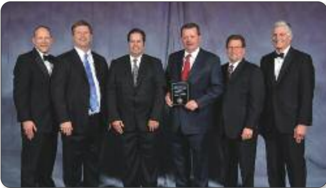
Ultimate Roofing Systems Cedar Park, Texas