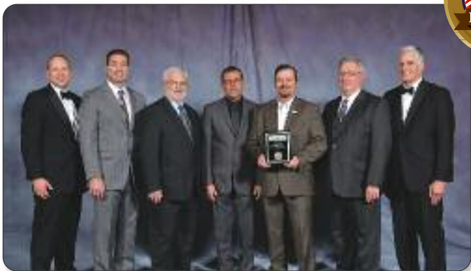
Pell Roofing Brazil, Indiana