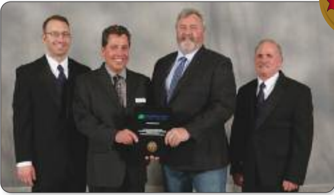
Sealtite Applicators, Inc. Cockeysville, Maryland