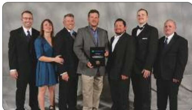
Roofs, Inc. Lubbock, Texas