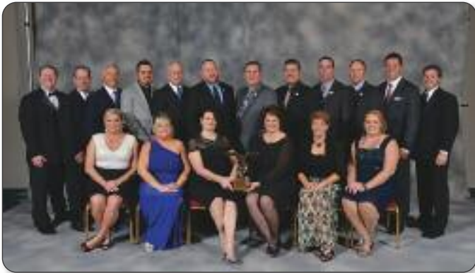
Technique Roofing Systems, LLC Burgoon, Ohio