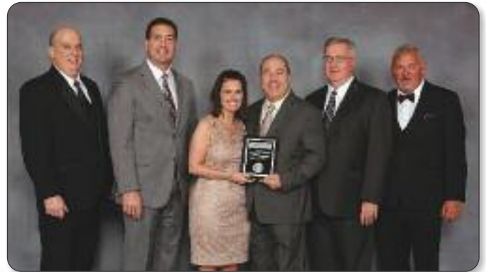
Complete Commercial Roofing Kokomo, Indiana