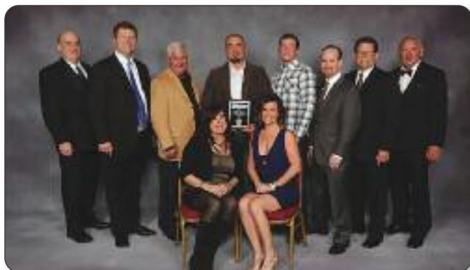
Greystone Roofing, LLC Krugerville, Texas