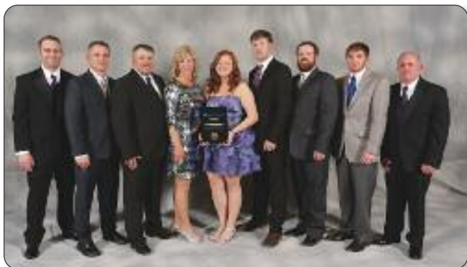
Construction Specialty Assoc. Eva, Alabama