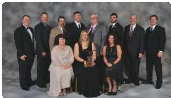
Reynolds Construction Co., Inc. White Hall, Arkansas