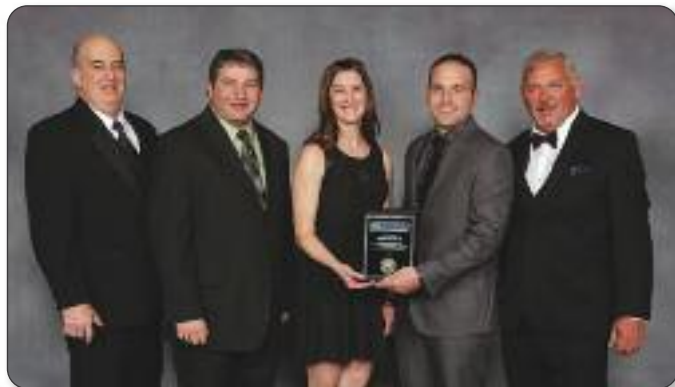
Mikalan Roofing, Inc. Zeeland, Michigan