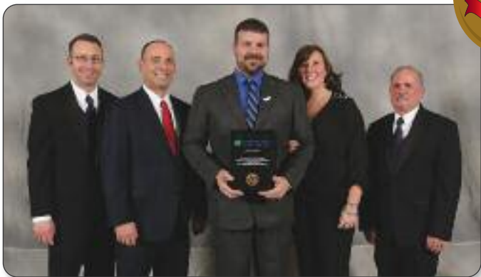
Holthaus Companies, Inc. Canton, Illinois