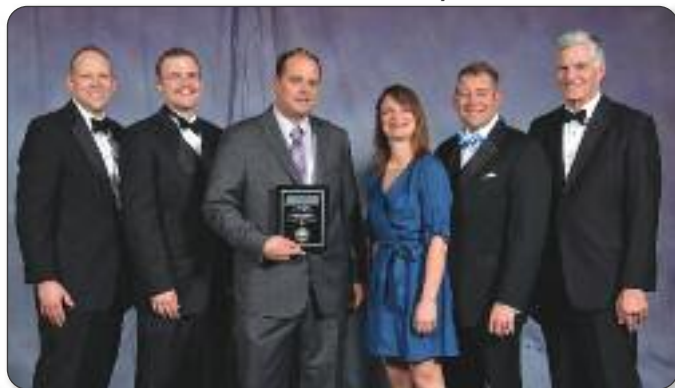
Texas Roof Systems Odessa, Texas