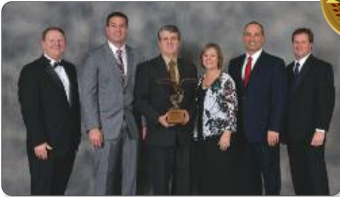
Sentry Roofing, Inc. Covington, Indiana