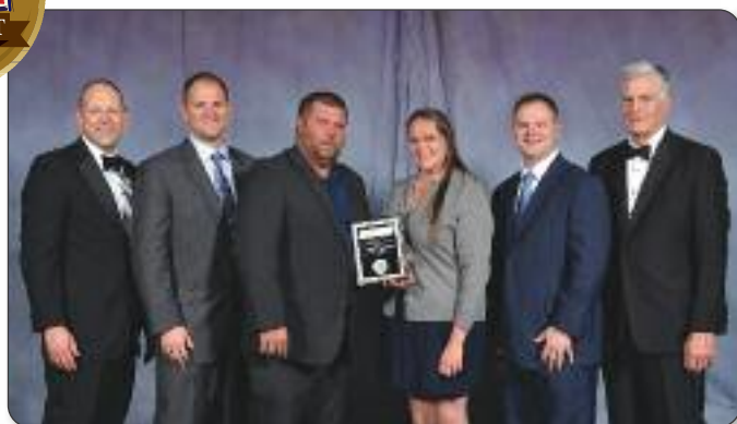
Precision Roofing Services, Inc. Sheboygan, Wisconsin