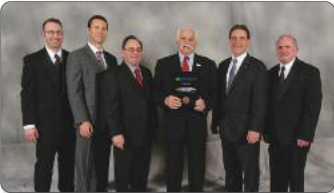
State Roofing Systems, Inc. San Leandro, California