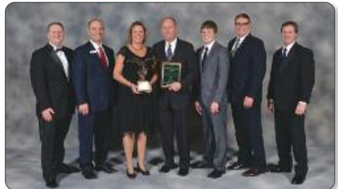
Duerson Corporation Altoona, Iowa