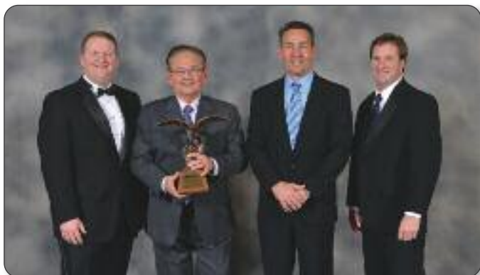
M.W. Morss Roofing, Inc. Romulus, Michigan