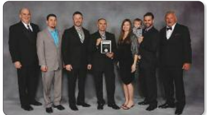
CRS Companies Dumont, New Jersey