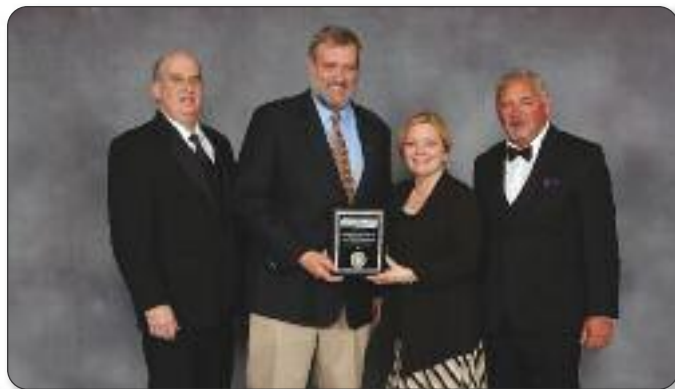
McDermott & Son Roofing Co. Atlantic, Iowa