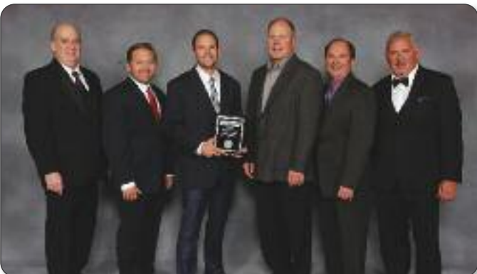
7 Summits Exteriors, LLC Colorado Springs, Colorado