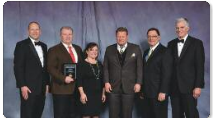
JD Ventures, LLC Germantown, Tennessee