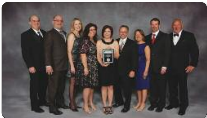
Frontier Contractors, Inc. Pittsburgh, Pennsylvania