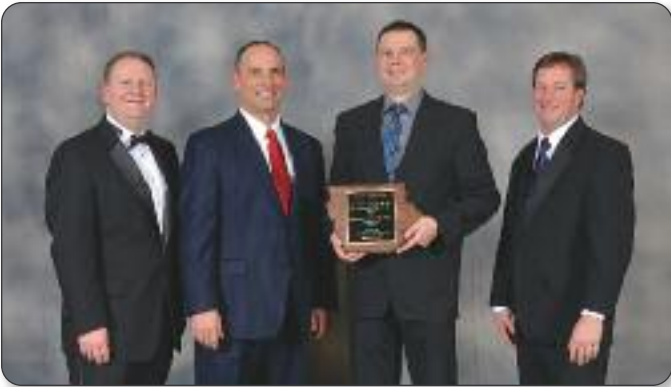
Allen Roofing & Construction, Inc. Monoma, Iowa