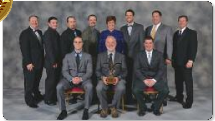
Springfield Construction Kingsley, Michigan