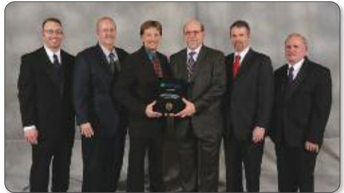
Umbrella Roofing Systems, Inc. Elwood City, Pennsylvania