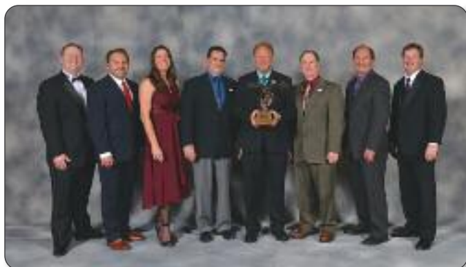
RTN Roofing Systems, LLC Loveland, Colorado