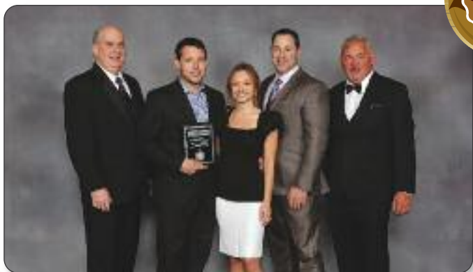
DH Cameron Construction Colchester, Vermont