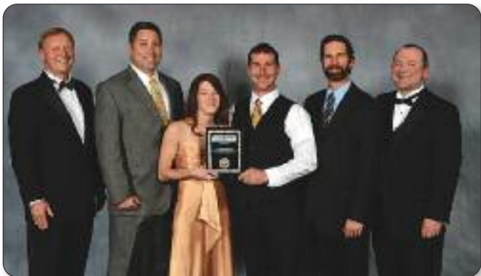
TRC Roofing Alpena, Michigan