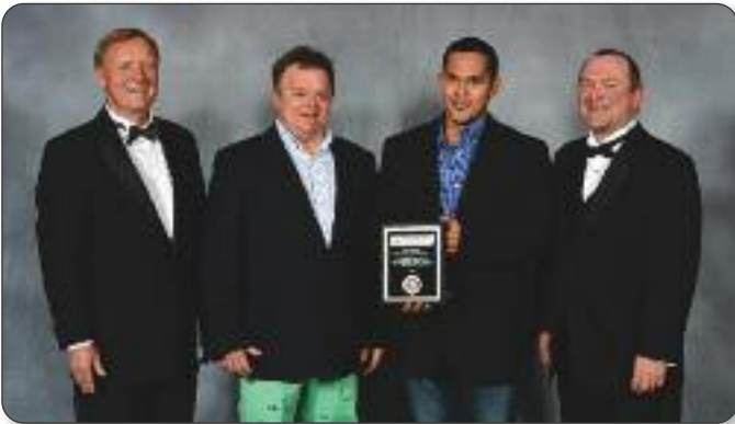
Professional Quality Roofing, LLC Silverton, Oregon