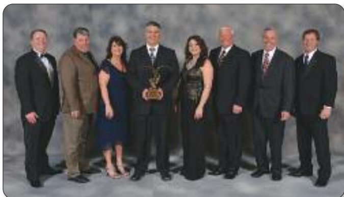
Roberts-McNutt, Inc. North Little Rock, Arkansas