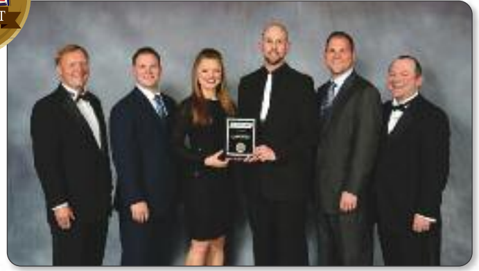
Eau Claire Roofing Co., Inc. Chippewa Falls, Wisconsin