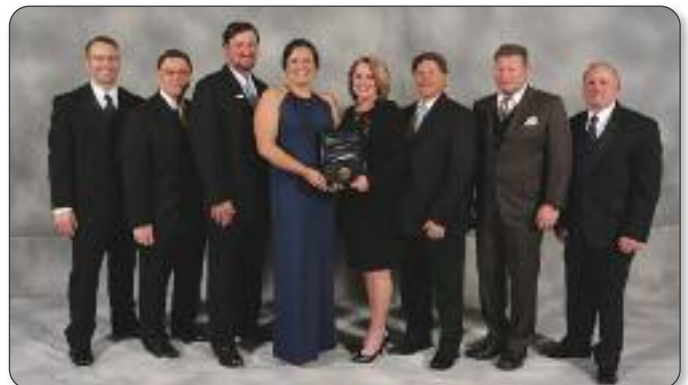
Watson Roofing Company Alamo, Tennessee