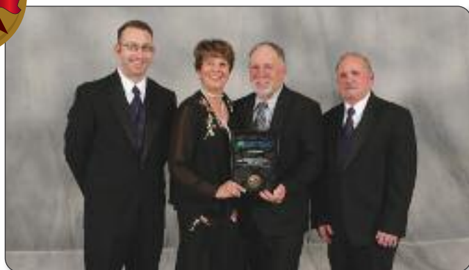
Industrial Roofing, Inc. Panama, Oklahoma