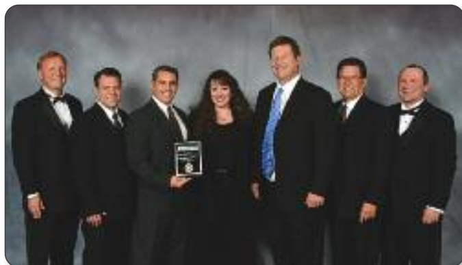
Trivan Roofing & Waterproofing Southlake, Texas