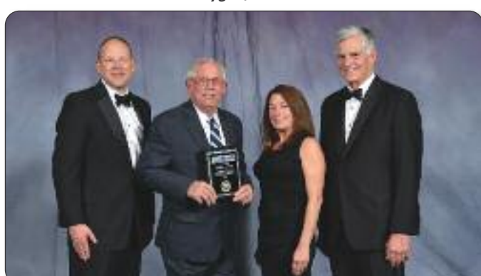
Roofing by Fred Gross Medford, New Jersey