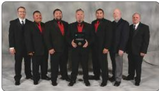
Magic Roofing & Construction Farmington, New Mexico