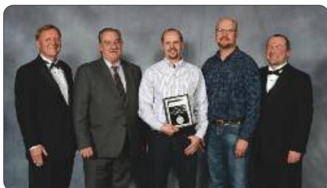
Venture Holdings Ltd. Taber, Alberta