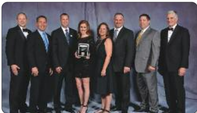
Marlette Roofing & Sheet Metal Co. Marlette, Michigan