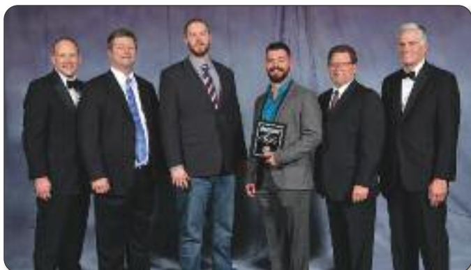
Merit Roofing Richardson, Texas