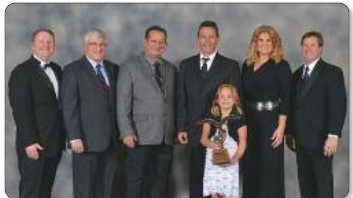
Wormley Bros. Roofing, Inc. Buford, Georgia