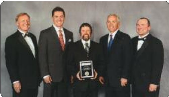
Cosam Contracting, Inc. Tiro, Ohio