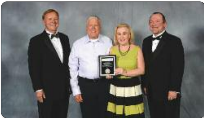
Sealtec White Roof, Inc. Burlington, Ontario