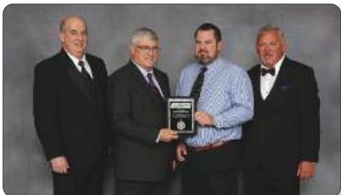
Hudson Specialty Group Barnesville, Georgia