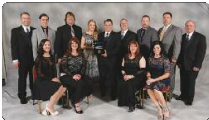
Great Lakes Roofing & Insulation Systems Sault Ste Marie, Michigan