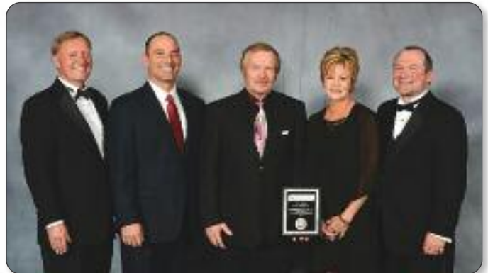
Cowan Roofing, Inc. Marshalltown, Iowa