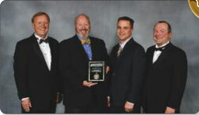
Old South Construction Wetumpka, Alabama