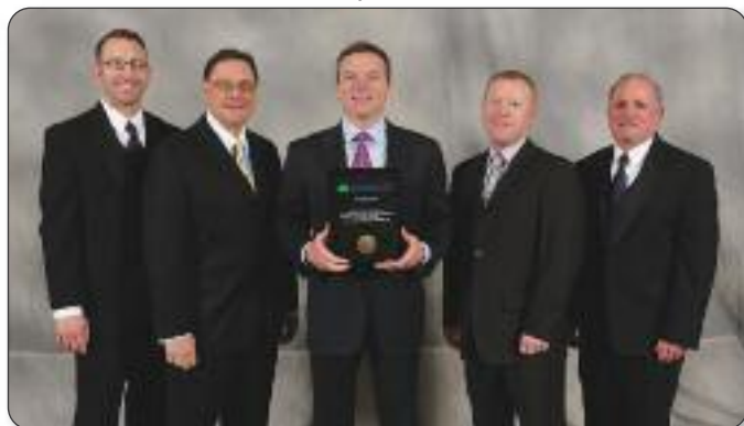
JBK, Inc. Corbin, Kentucky