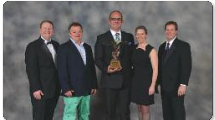
Washington Roofing Company McMinnville, Oregon