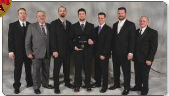
Southland Roofing, Inc. Regina, Saskatchewan