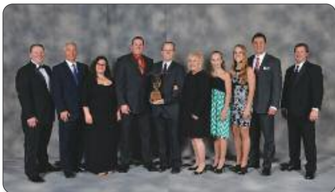
Ohio & Indiana Roofing Co. St. Henry, Ohio