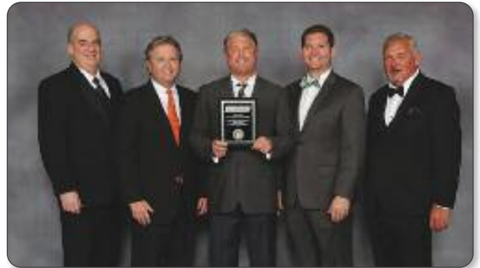
Coastal Roofing Co., Inc. Charleston, South Carolina