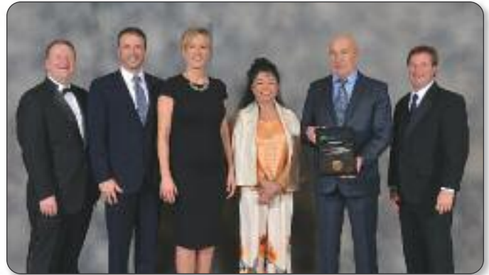
Alternative Roofing Systems, Inc. Snohomish, Washington