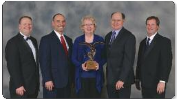
Tomkat Roofing, Inc. Streator, Illinois