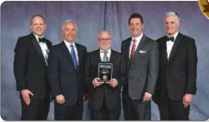
Tusing Builders, Ltd. Monroeville, Ohio