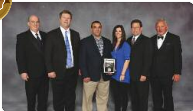
Done Right Roofing & General Contracting Milano, Texas