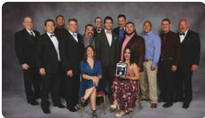
McAllen Valley Roofing Co. McAllen, Texas