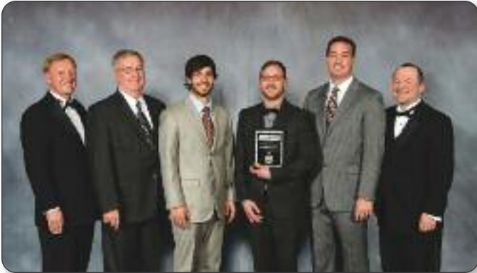
Borntrager Enterprises, Inc. Goshen, Indiana