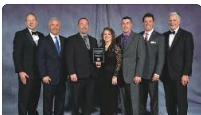
M & W Construction Co., Inc. Lima, Ohio