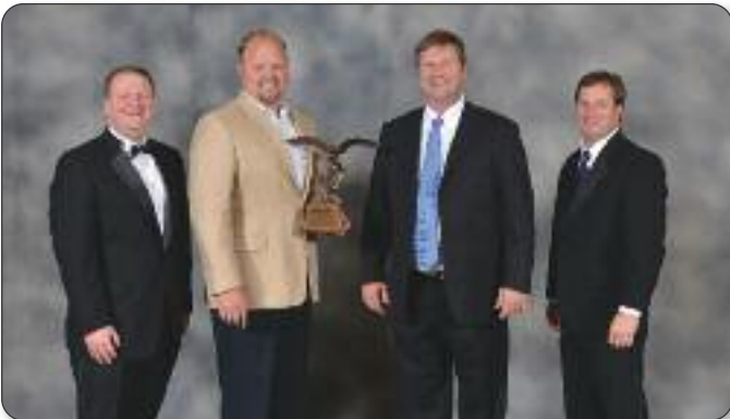
D.K. Haney Construction Fort Worth, Texas