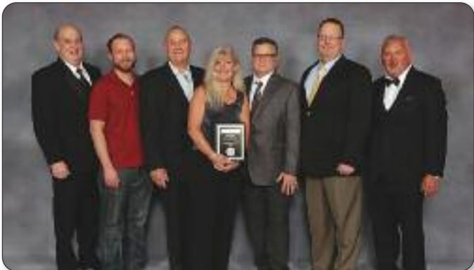
Copley Roofing, Inc. Crystal Lake, Illinois