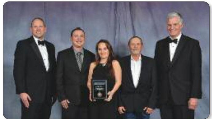
Vogler Sheet Metal Co. Houston, Texas