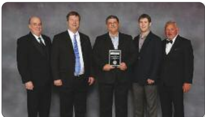
Engineered Roofing Systems Montgomery, Texas