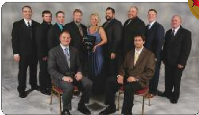
Nasi Roofing, LLC Minocqua, Wisconsin