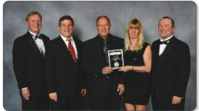
Saco Roofing Saco, Maine