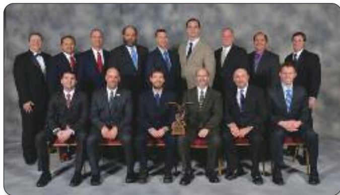
Jewett Roofing Company Greenville, Illinois