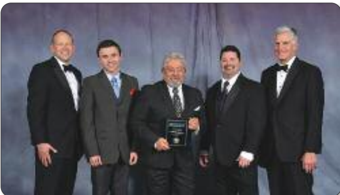
Watertite Roofing Dunnville, Ontario