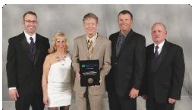
Four Seasons Energy Efficient Roofing Marine St. Croix, Minnesota