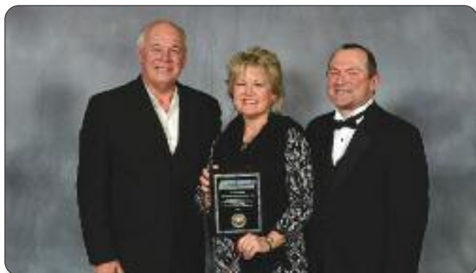
Monument Constructors, Inc. Beaumont, Texas