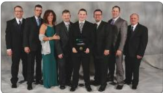
JAM Associates, Inc. Poughkeepsie, New York