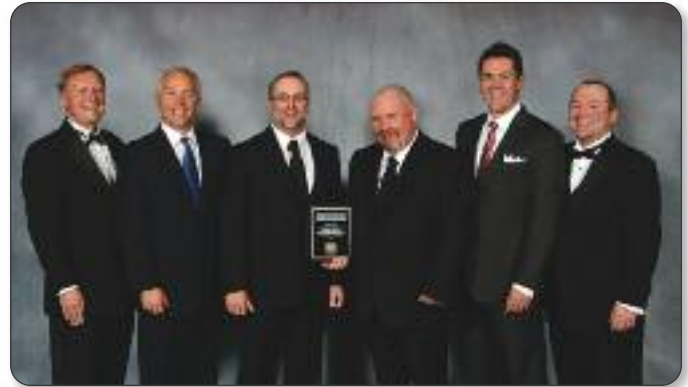
All Weather Systems, Inc. Newark, Ohio