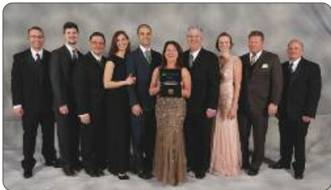
Roofing Solutions, Inc. Louisville, Kentucky