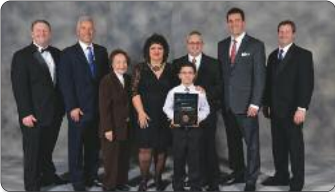
Ampco Roofing Copley, Ohio