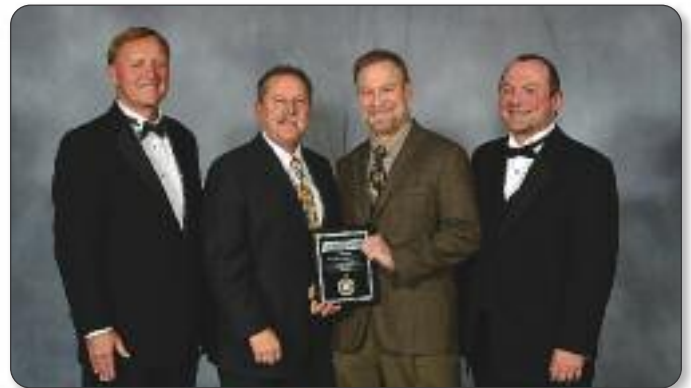
Select Construction Co. Asburn, Virginia