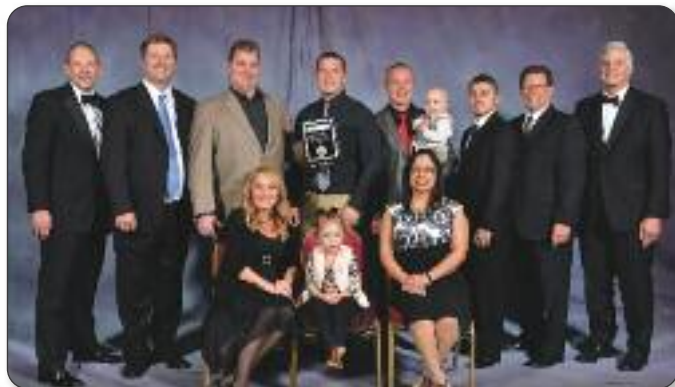
Trumble Construction, Inc. Nash, Texas