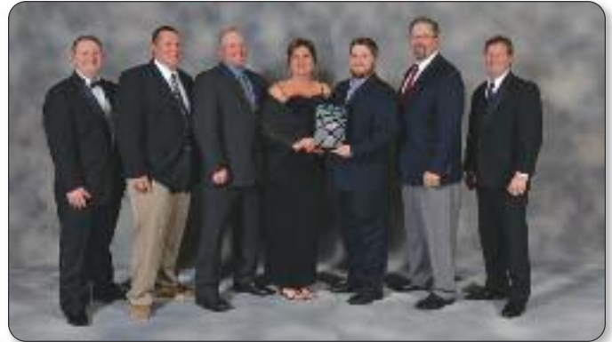
B & M Roofing Contractors Rocky Mount, North Carolina