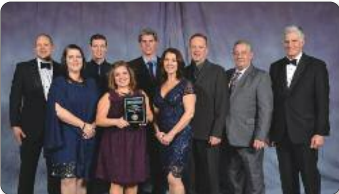
Goodmen Roofing Calgary, Ltd Airdrie, Alberta