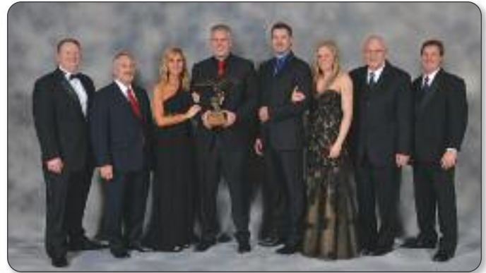
Coryell Roofing New Castle, Oklahoma