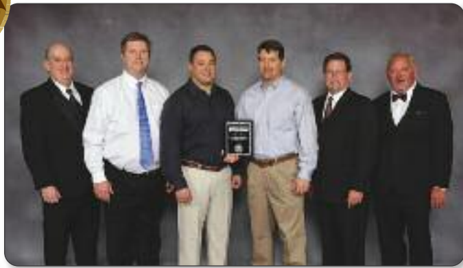
Lone Star Roof Systems College Station, Texas