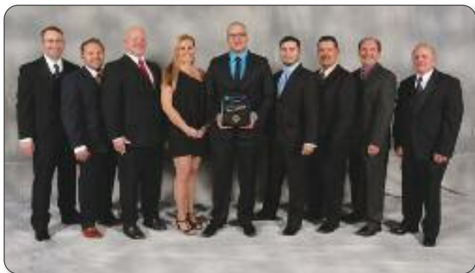
Presidential Roofing Parker, Colorado