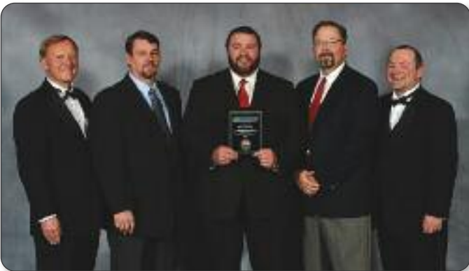
Etheridge Roofing Wilson, North Carolina