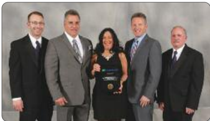
Rest Assured Roofing Howell, New Jersey