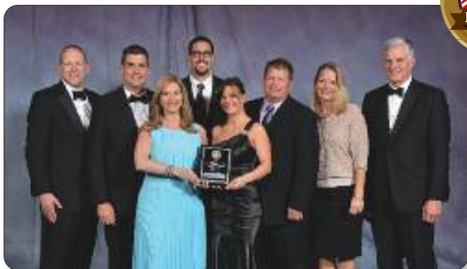
Kelly Roofing Naples, Florida