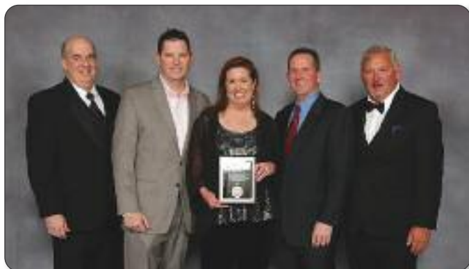
Freeport Industrial Roofing, Inc. Freeport, Illinois