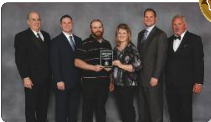
Kimmons Roofing & Ventilation Merrill, Wisconsin