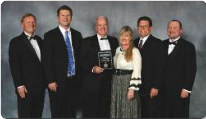
Acme Roofing Company San Antonio, Texas