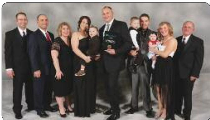
Grell Commercial Roofing, Inc. Fort Dodge, Iowa