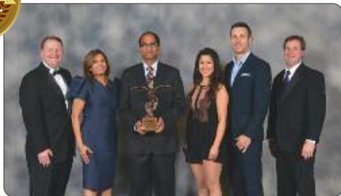
Guycan Aluminum, Ltd. Uxbridge, Ontario