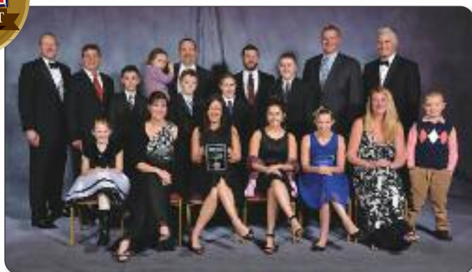
Kidd-Luukko Corporation Worcester, Massachusetts