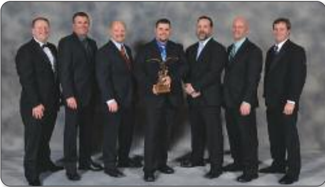
All Elements, Inc. Monticello, Minnesota