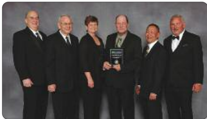
Mid-West Roofing & Sheet Metal Kearney, Nebraska