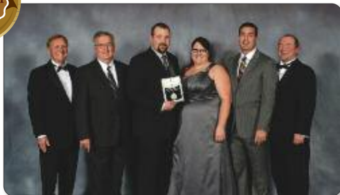
S.T.A. RoofTechs, LLC Valparaiso, Indiana