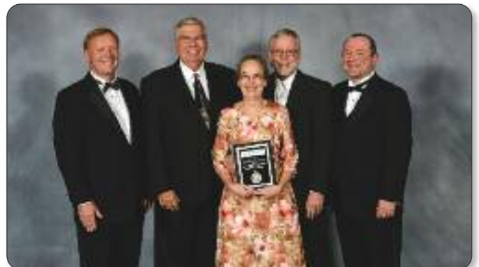
Southern Roofing Company West Point, Mississippi