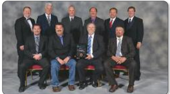
Broken Arrow, Inc. Tooele, Utah