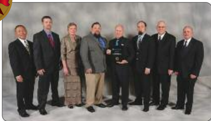
Ciaccio Roofing Corporation Bellevue, Nebraska