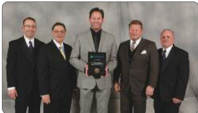
MC Roofing, Inc. Fort Thomas, Kentucky