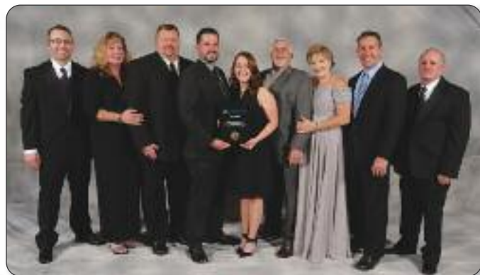
Roof Management Co., Inc. Farmington Hills, Michigan