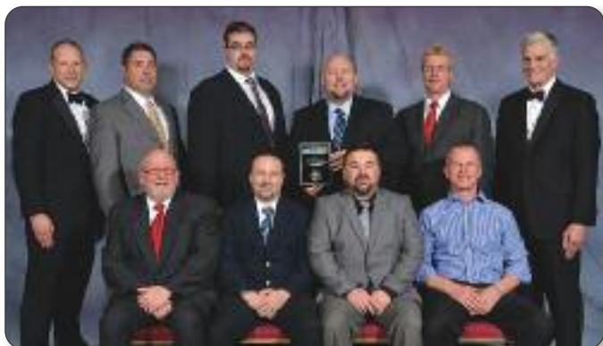
Lake State Roofing, Inc. Iron Mountain, Michigan