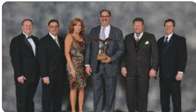
LaFerney, Inc. Kingsport, Tennessee