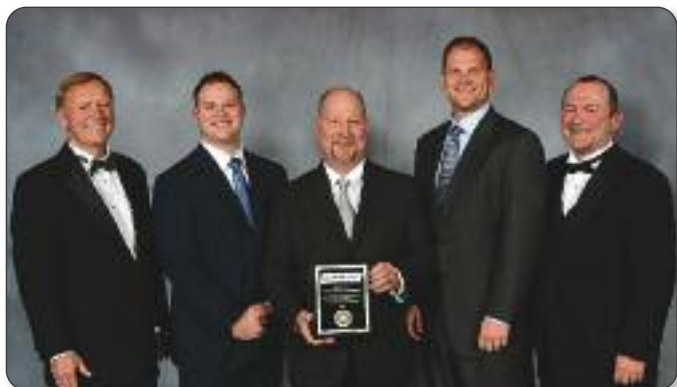
Traska Roofing & Ventilation Wausau, Wisconsin